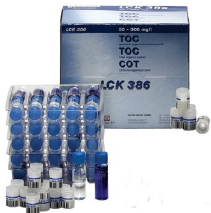
Cuvette test for TOC determination by the purging method