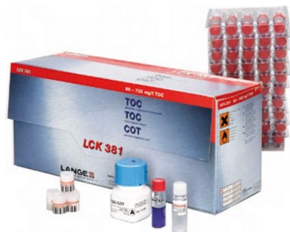
Cuvette test for TOC determination by the difference method