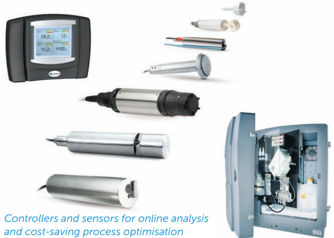
Controllers and sensors for online analysis and cost-saving process optimisation