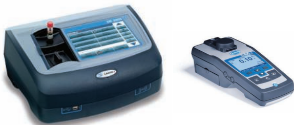
Benchtop and portable instruments for lab analysis inspection, maintenance and equipment qualification services available

* For additional parameters and solutions please contact your local Hach representative or visit our website.